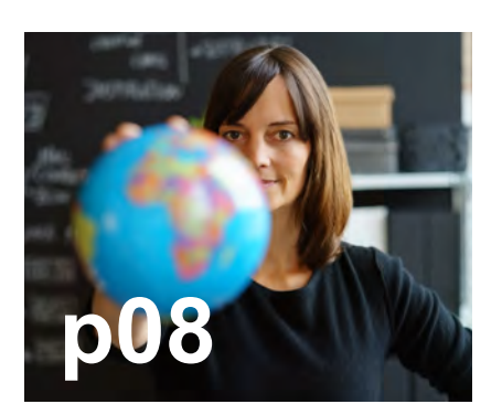
Talent beyond our borders: making the most of Canada's immigration programs