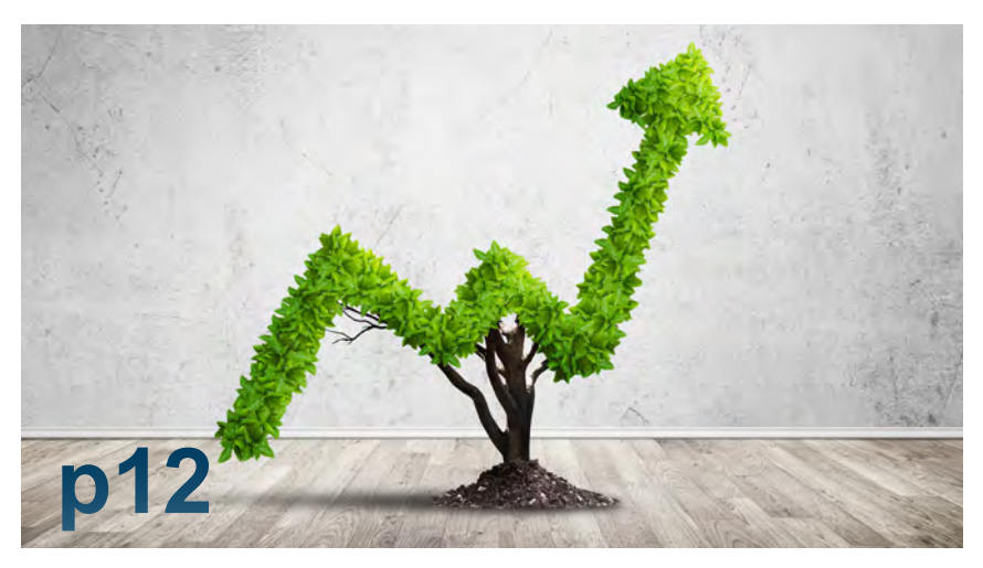
Cover Story: Environmental, social and governance factors in pension and endowment fund investment